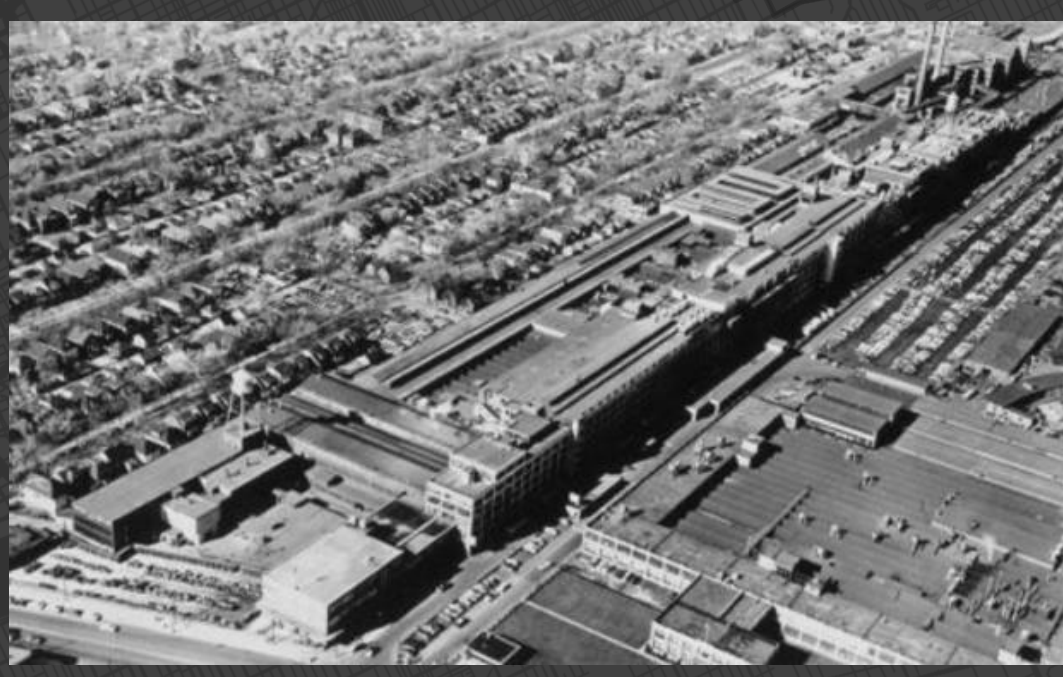
1954 Mack Avenue Stamping Plant (formerly Briggs Mack Avenue)