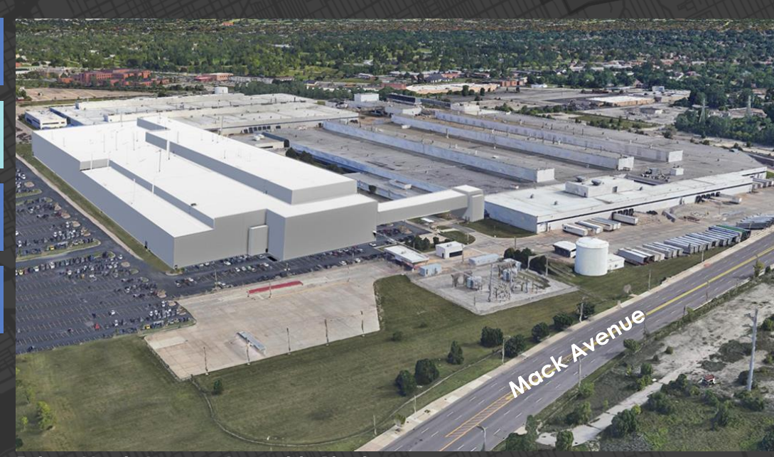
Future Mack Avenue Assembly Plant